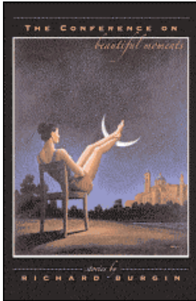
Conference on Beautiful Moments

Hardcover ISBN: 0801885183 Pub. Date: November 2006 Series: Johns Hopkins, Poetry and Fiction Ser. Paperback