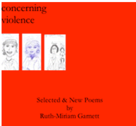
concerning violence: Selected & New Poems